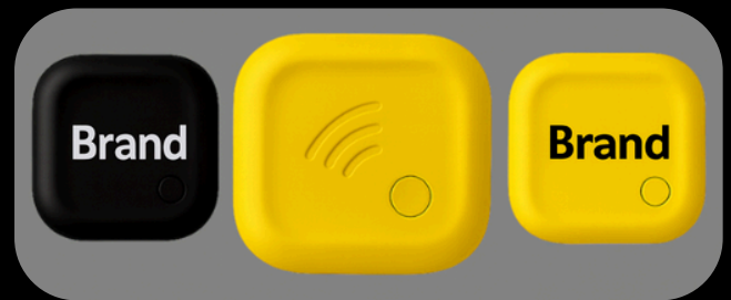
Customizable design option

AirTag Zone: The AirTag Zone is the base area where Corevo AirTags communicate with the system. It can be positioned flexibly anywhere within the display area, offering maximum setup freedom and reliable wireless connection between the tagged Nikon products and the screen content.